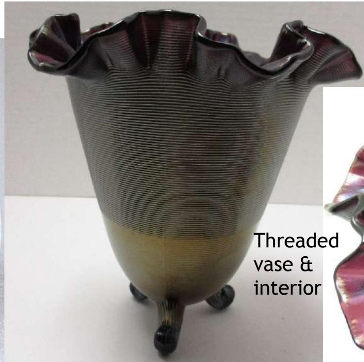
Threaded vase & interior