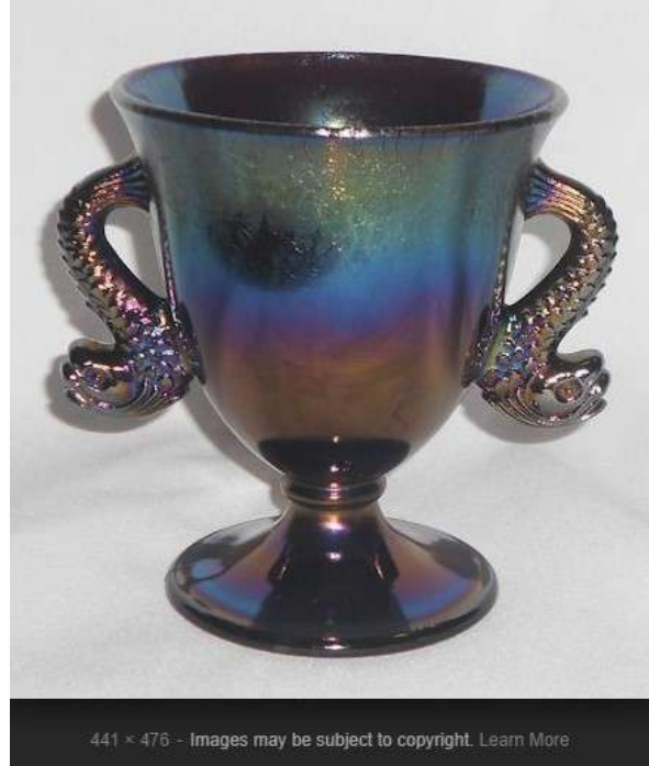
Says Levay on Collector's Showcase Is it SGS souvenir?