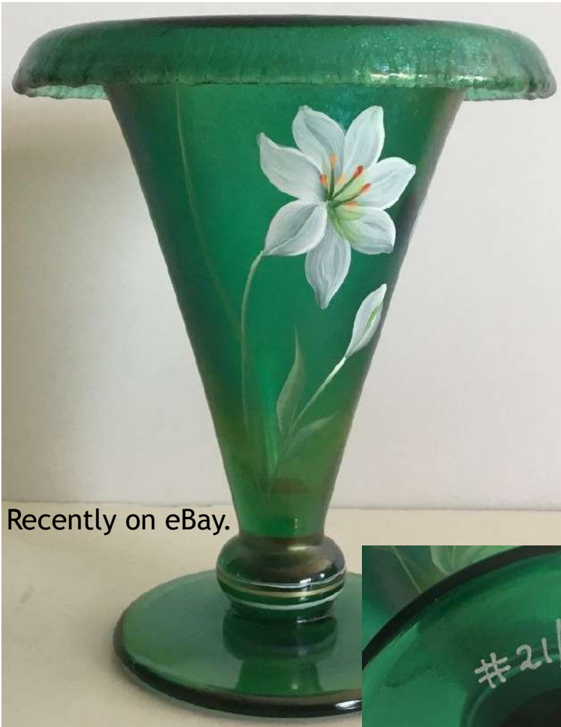
Recently on eBay.