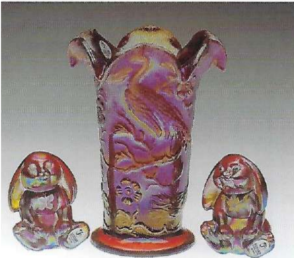
(Left) Banquet Favor: Ruby Stretch Bunny painted with White Butterfly on chest and White Accents.