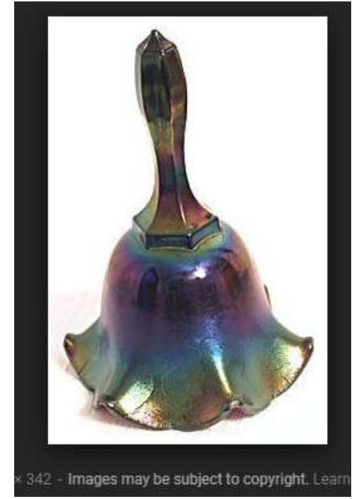
found on Pinterest